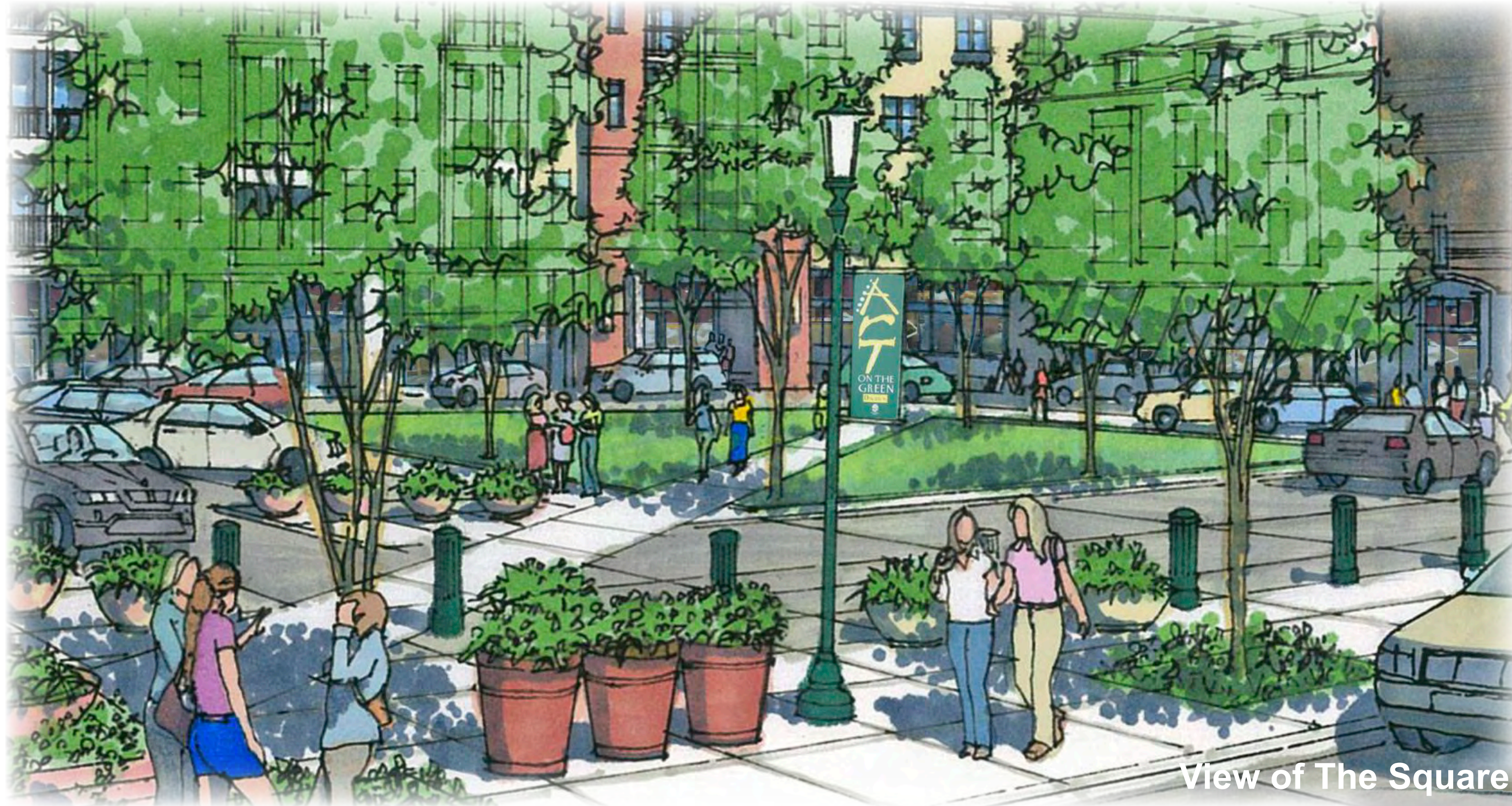
View of The Square